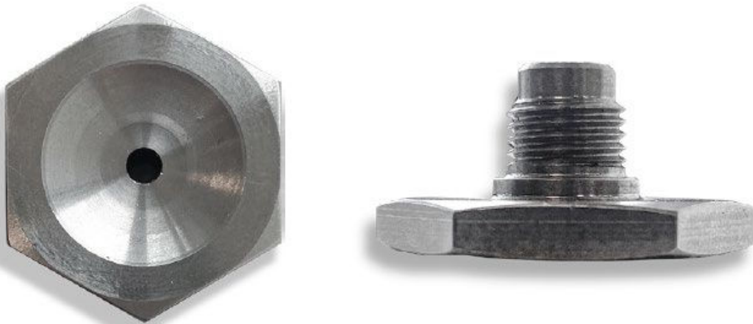
Image 4 – Vitrafix Nose Piece Adapter to suit Vitrafix A3 stainless steel rivets

When carrying out works on site, once the panels are installed, including those that require the use of glues, silicones, or sealants, care must be taken not to mark the Ceramapanel ® A1 panels with such products, which would result in irreparable damage.